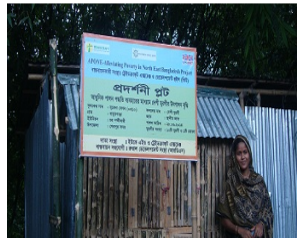
1.1.3: Successful women Poultry farmers are being recognized by zilla Agriculture Porishod and Development Wheel