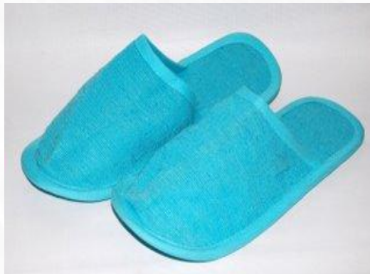
17. Jute shoes