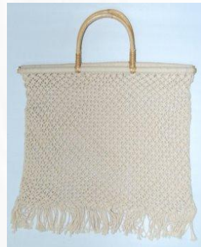
3. Big handle bag