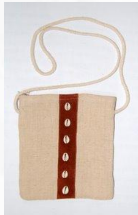
9. Side bag