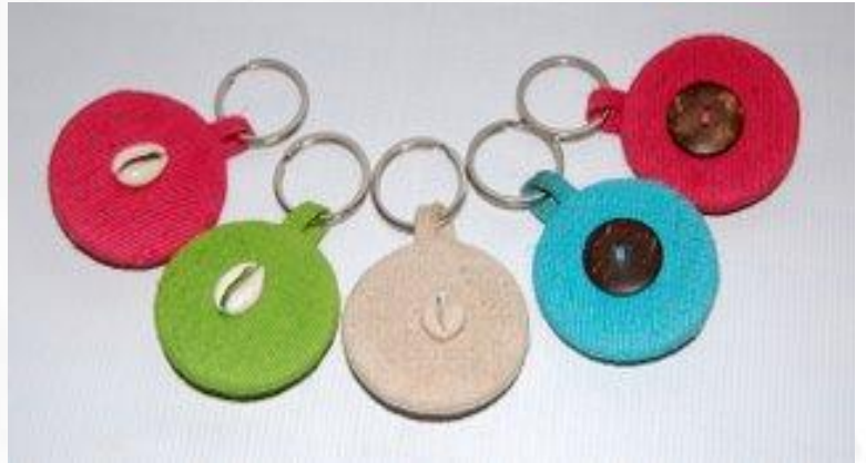
14. Key ring

Additionally, by buying these kind of products you contribute to the support of artisans in Bangladesh so that they can live with dignity because of their handcraft income.