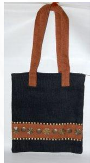
6. Side bag