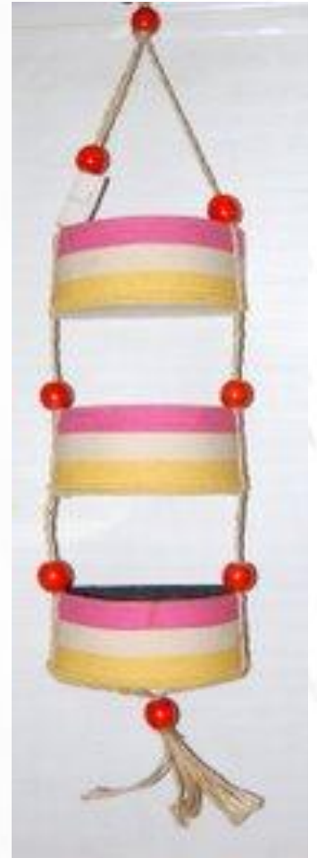
18. Hanging jute shelf