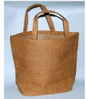
2. Shopping bag