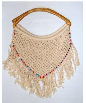
4. Small handle bag