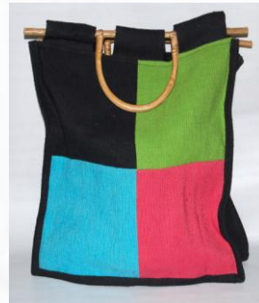
1. Shopping bag