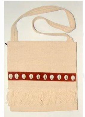
8. Side bag