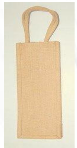
12. Bottle holder