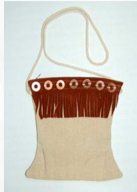
7. Side bag