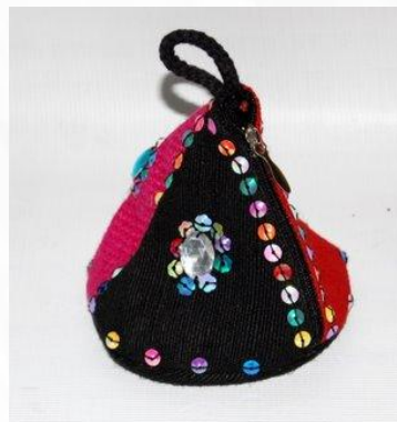
11. Children' bag