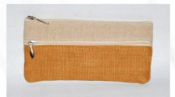
20. Small purse