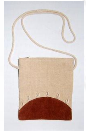
10. Side bag