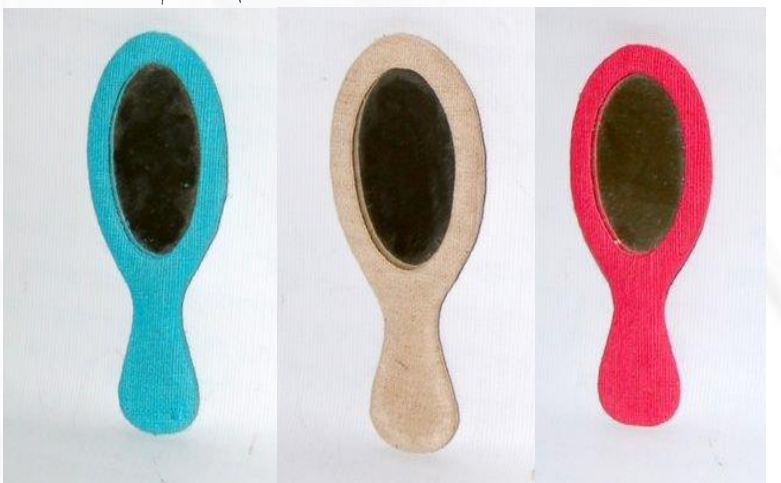
16. Oval mirror