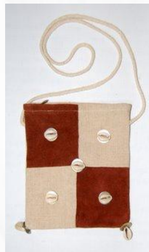
5. Small bag