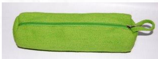
19. Pen holder